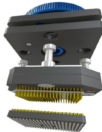
Test Socket (Plugged into adapter)

The E-tec Interconnect SMT Solderball MGS adapter emulates the package footprint and is easily installed using standard flux and reflow techniques. The solder ball adapters have the same solder ball types as the package's they are emulating. You can combine the SMT foot with any of the E-tec Test socket styles shown in the Test Socket catalogue. The Test Socket is plugged into these adapter, which will be delivered with gold plated through hole pin and alignment plate for easy insertion. We offer any pin-out, configuration and grid size for pitch 0.8mm, 1.00mm and 1.27mm.